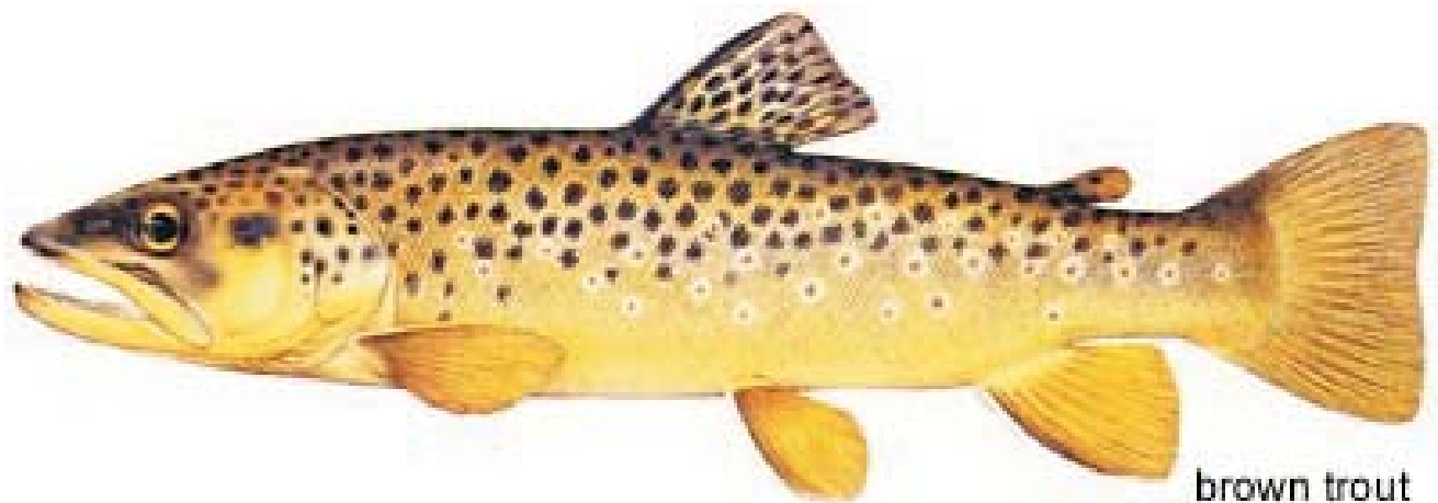
brown trout