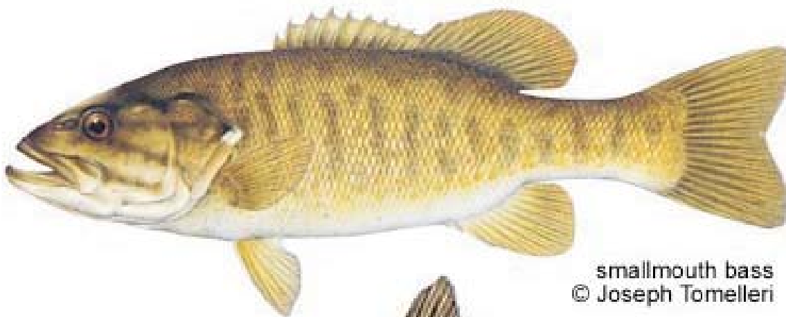
smallmouth bass © Joseph Tomelleri