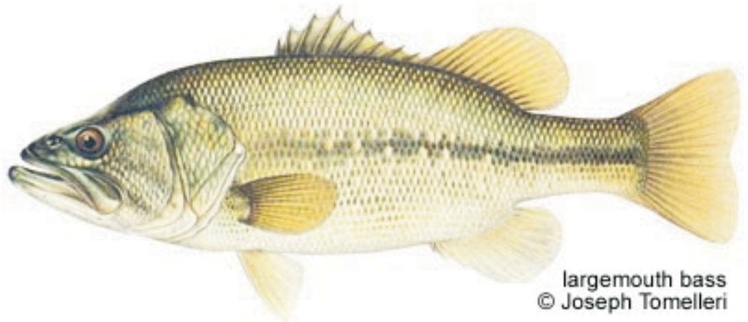
largemouth bass © Joseph Tomelleri

Above fish are from this site Http://www.dnr.state.mn.us/fishing/index.html