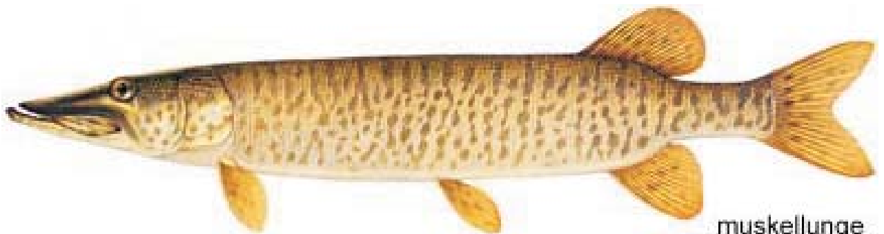
muskellunge © Joseph Tomelleri