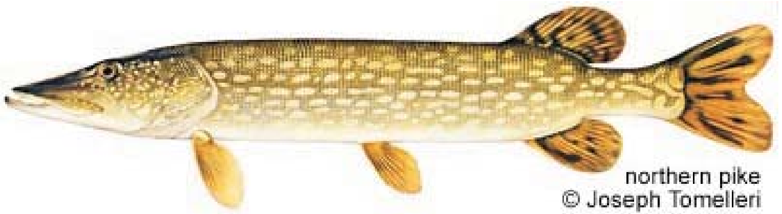
northern pike © Joseph Tomelleri