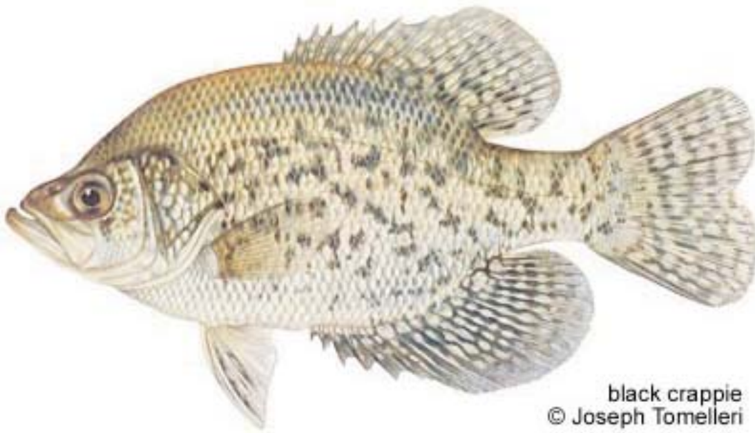
black crappie © Joseph Tomelleri