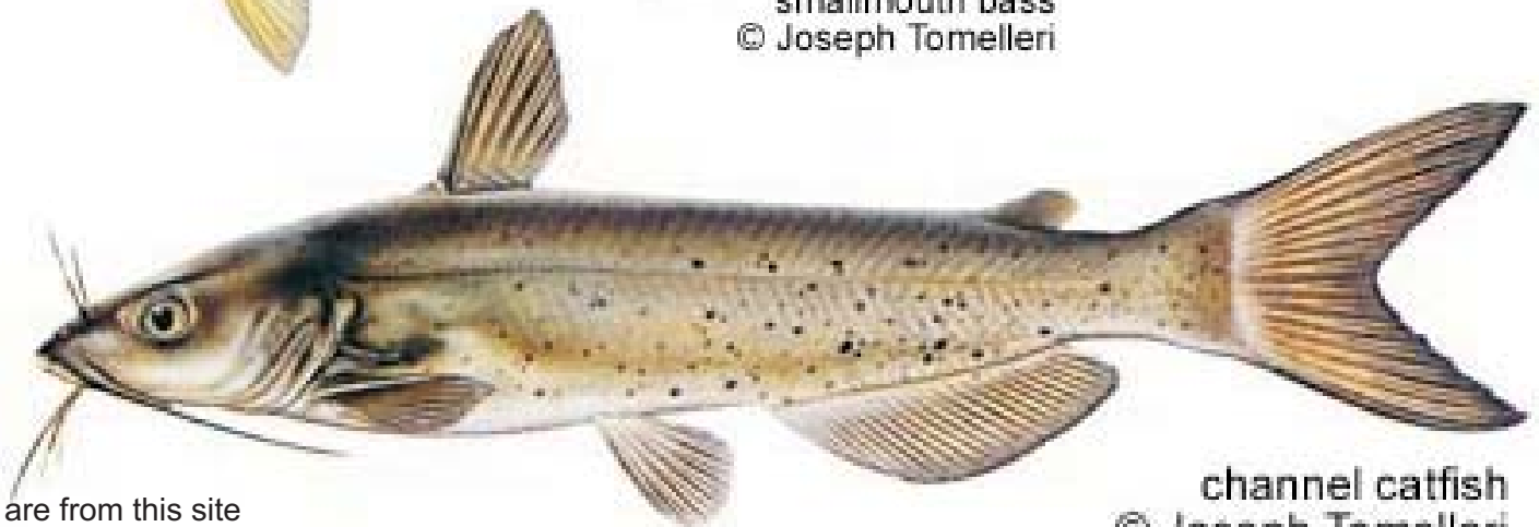
channel catfish © Joseph Tomelleri

Above fish are from this site Http://www.dnr.state.mn.us/fishing/index.html